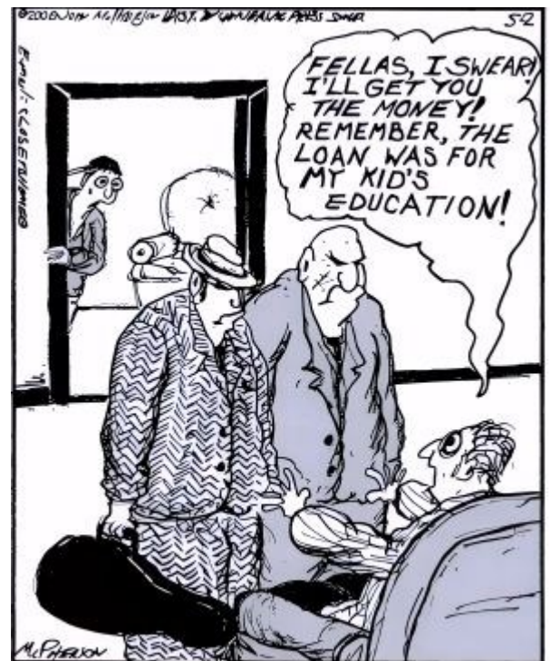
Frustrated by his son's lousy college grades, Bob hires some local actors to help out.

I just read a book on marriage that says treat your wife like you treated her on the first date. So after dinner tonight I'm dropping her off at her parents' house.